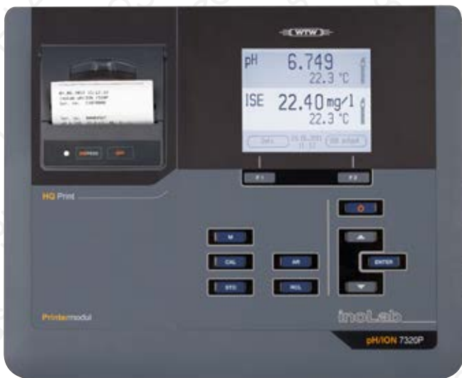
inoLab® pH/ION 7320