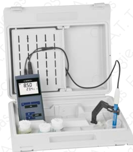
Set in case