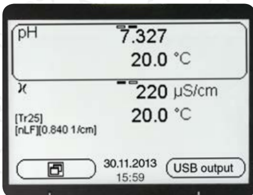
Display with two measured values