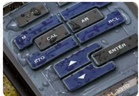
Robust sealed silicone keypad - 100% waterproof

Ease-of-use guarantees dependable results whether measuring surface water or the chemical process.